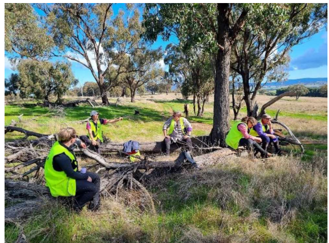
The Quandong Ride offers more great views of the Weddin Mountain, particularly at the lunch spot.

*Please note: the information provided in this document is correct at the time of writing. The Weddin Mountain Muster Committee reserve the right to change the format of the rides if necessary.