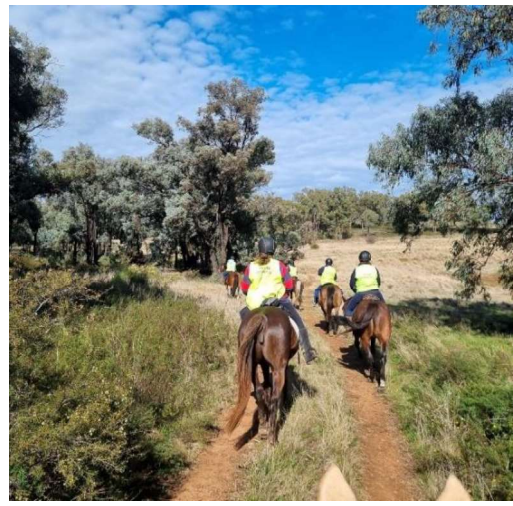
Views of the Conimbla Range and trekking around the hill on the Quandong Ride.