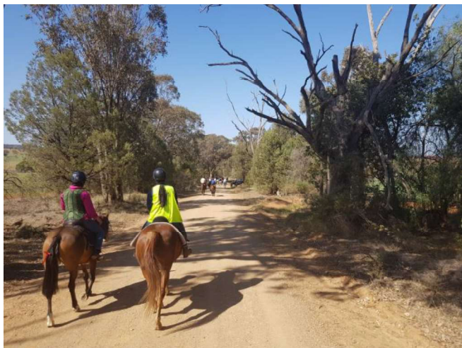
Ambling along the Quandong Road on horseback – where else would you want to be?

We follow the relatively quiet public road, turning east along the old Koorawatha – Grenfell railway line, which is no longer used. This is a lovely road with part of it shaded by lovely old yellow box and grey box trees. Even though the road is wide and relatively quiet, please make sure you stick to the left and only ride 2-abreast.